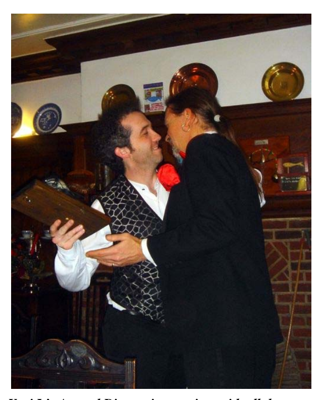
Yes! It's Annual Dinner time again – with all that that entails...

on <u>a.frost@ukintpress.com</u> to arrange their return. Do not send them to his work address as he rarely bothers to work these days, and don't delay, as we've got to get them in to the engravers in the next week.